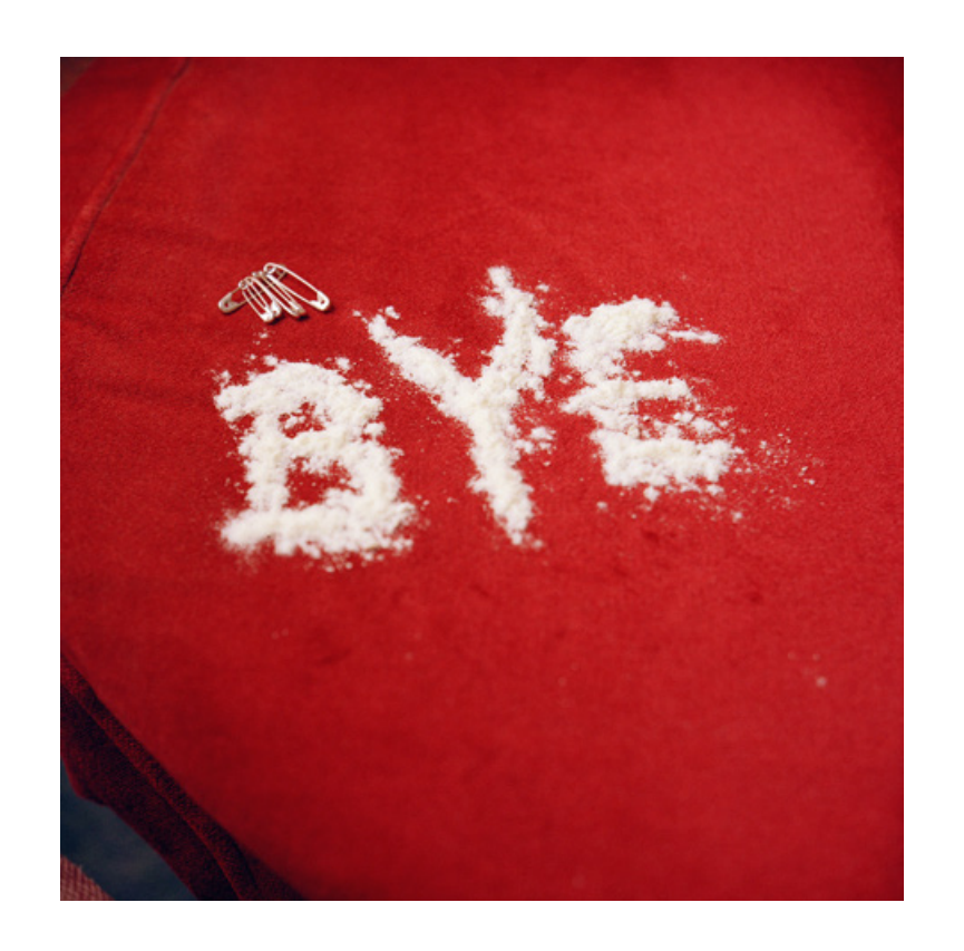
All that remains