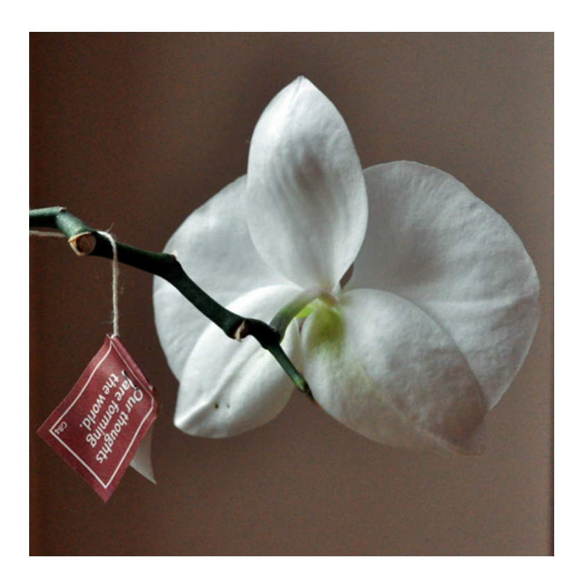
Our Thoughts are Forming the World