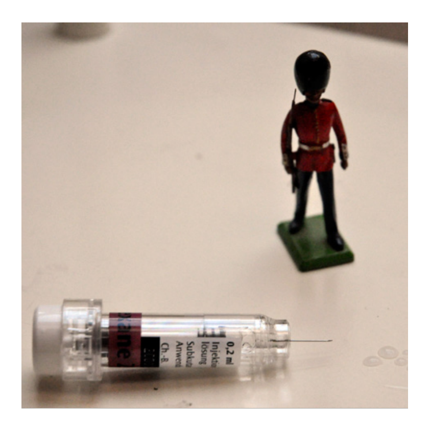
Heparin Plated Armour

In Things are strange, we see a white liquid poured carefully from a miniature teapot into a tiny cup. Ryley has noted that in other cultures vessels pouring out liquid have been used as a metaphor for miscarriage. The size of the pot suggests this is a child's toy perhaps taken from a toy house used by children to play and fantasize about domestic life, the home and the family. The play with scale is interesting, suggesting an Alice in Wonderland type world we may be attempting to enter if we drink from the cup. Yet these objects seem to carry a symbolic sadness to them as the toy that the missing child will never play with. The physical distance of the couple also suggests the wider impact loss has on couples which can often cause huge rifts and gulfs between partners unable to cope with each other's responses to grief. Ryley is bravely taking on new visual territory in this work, which is of course as much about words as images. We need to go on that journey with her to ensure that in the future there will be a contemporary visual language that speaks of this experience for all the women who are yet to go through such loss. At least they will know they are not alone.